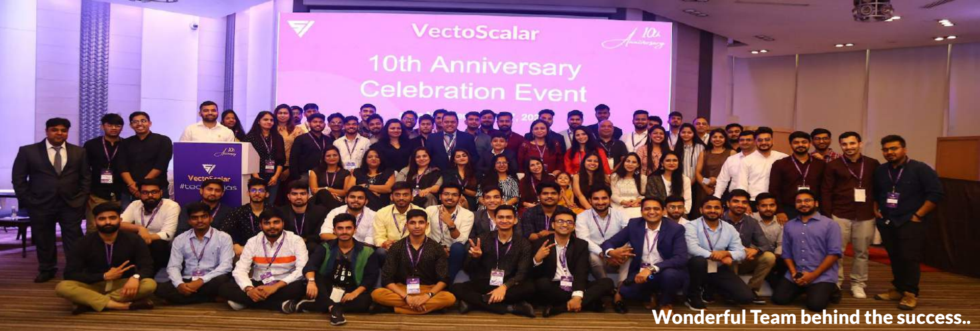
Wonderful Team behind the success..

VectoScalar is the leading Technology Partner for Mobile/Web App Development & Cloud Consulting and the go-to strategic partner for Amazon Web Services .